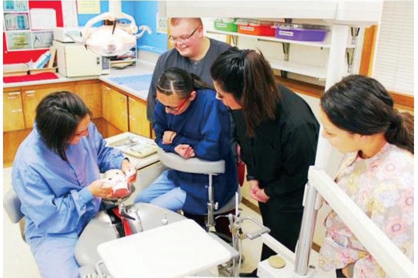
Dental assisting students observe an instructor demonstration.

MOHF also discussed how to further promote the Doug and Sue Hadnot Fund in the coming weeks at your dental society meetings. This fund was created last year in conjunction with the Montana Community Foundation to allow dentists to take advantage of the Montana Endowment Tax Credit in their giving. A $5,000 gift to this fund will be offset by nearly $3,000 in state tax credits and federal tax write-offs. MOHF is seeking 50 dentists to donate $5,000 to the fund in 2018. The more assets in the endowment, the higher our guaranteed return will be. Checks can be made out to the Doug and Sue Hadnot Fund and sent to the MDA office.