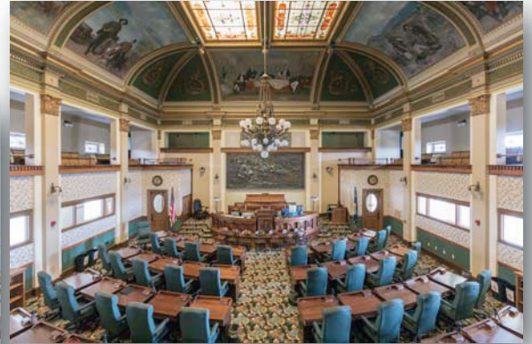
Montana Senate Chamber