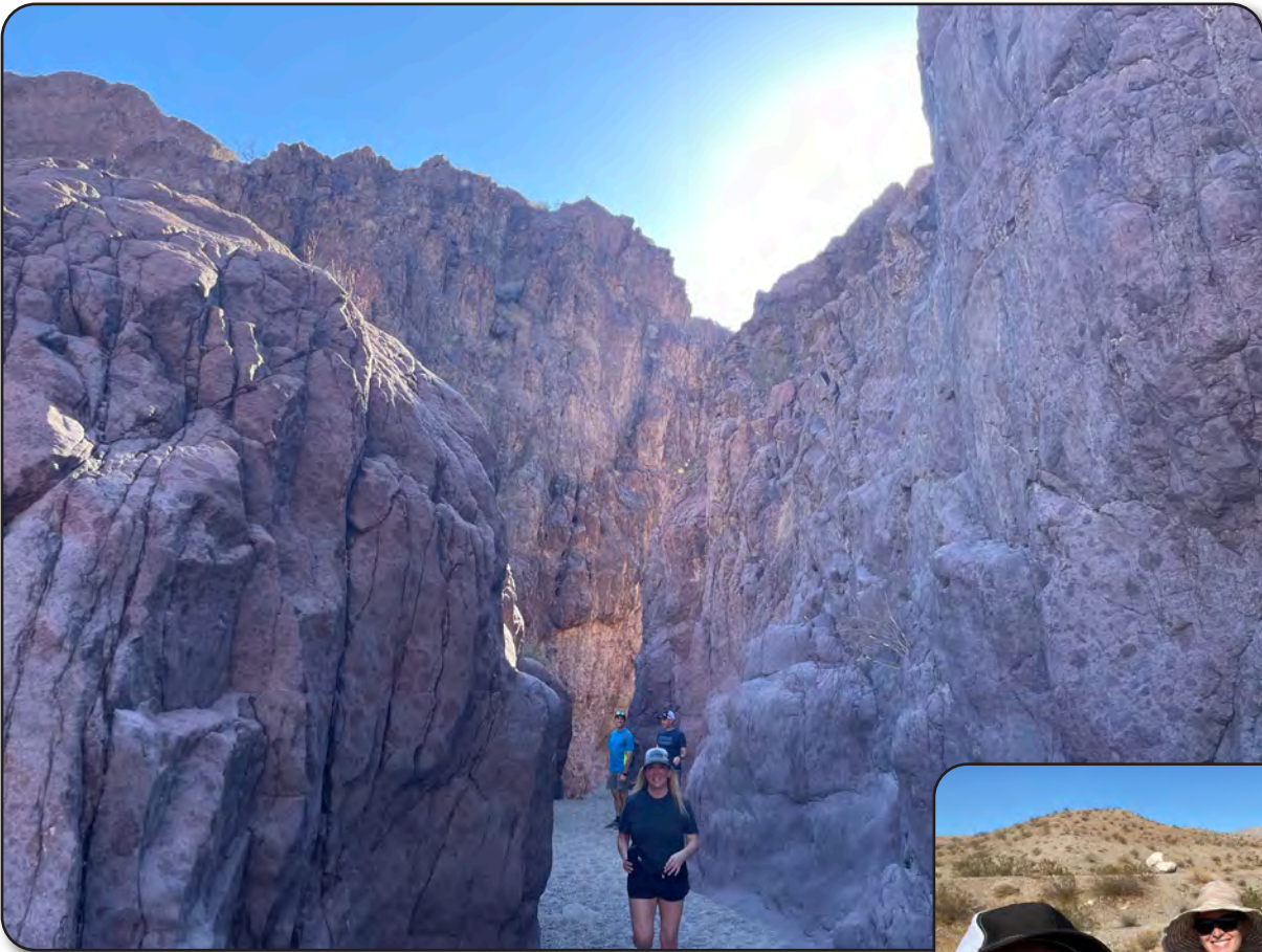
MDA delegates take a break from the action to hike the Arizona Hot Springs area near Hoover Dam.