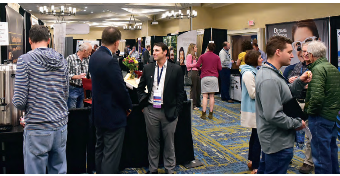
MDA sold out all exhibit spaces for the 4th year in a row.