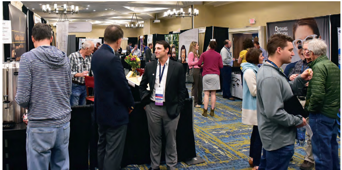
MDA sold out all exhibit spaces for the 4th year in a row.